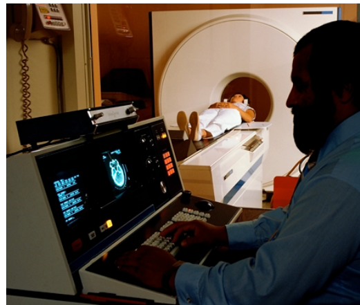
Figure 2. The technologist controls the CT table and communicates with you through an intercom.

There is a slight risk from X-ray radiation exposure, and some people are sensitive to the contrast agent. The most common side effects from the contrast are a brief metallic taste in your mouth and a feeling of warmth throughout your body. An